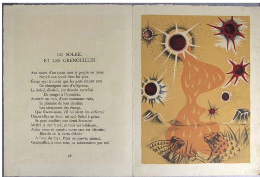
La Fontaine, Jean de and Lurçat, Jean. Vingt fables. Lausanne: André Gonin, 1950. The illustration here depicts the fable of Le soleil et les grenouilles.

felt fellow-feeling with the frogs in an illustration of La Fontaine's fable 'The sun and the frogs' as they stewed in their pond beneath the burning sun.