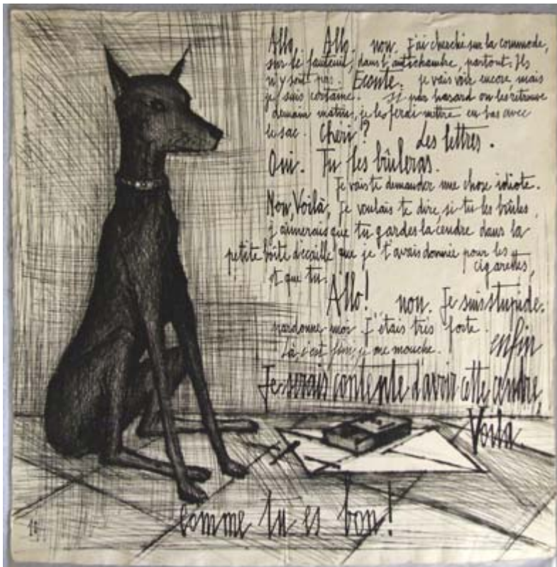
Cocteau, Jean and Buffet, Bernard. La Voix humaine. Paris: Parenthèses Lacourière, 1957.